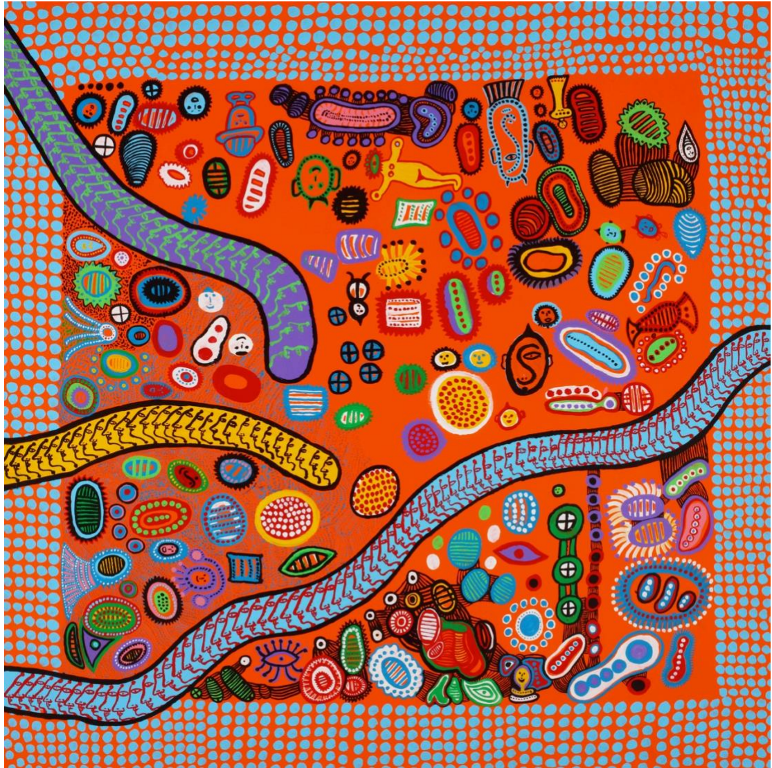
Prayers for Peace , 2015, ©YAYOI KUSAMA, Courtesy of Ota Fine Arts, YAYOI KUSAMA FOUNDATION