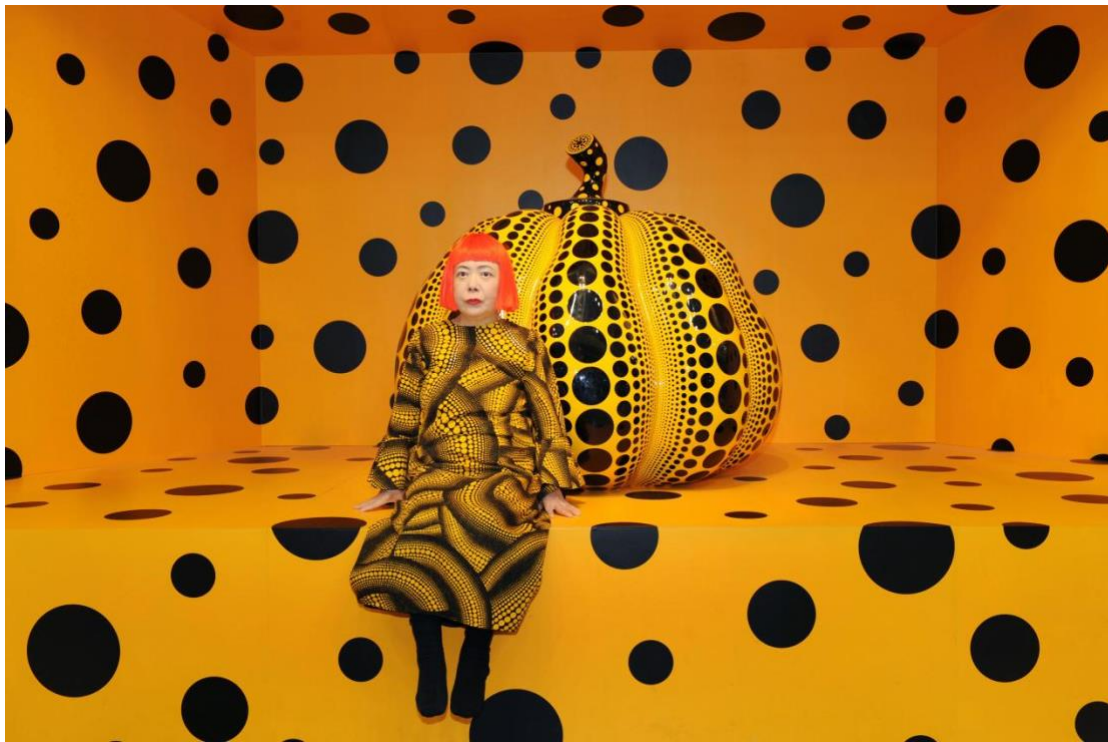
Kusama with Pumpkin at Aichi Triennale, 2010

In the context of her work " Life of the Pumpkin Recites, All About the Biggest Love for the People, " these ideas take on even greater significance. The installation not only reflects Kusama's deeply personal connection to the pumpkin but also serves as a powerful metaphor for unity and collective harmony. By bringing this work to China, Kusama extends her message of love and peace to a global audience, reinforcing the enduring importance of connection and support in today's world.