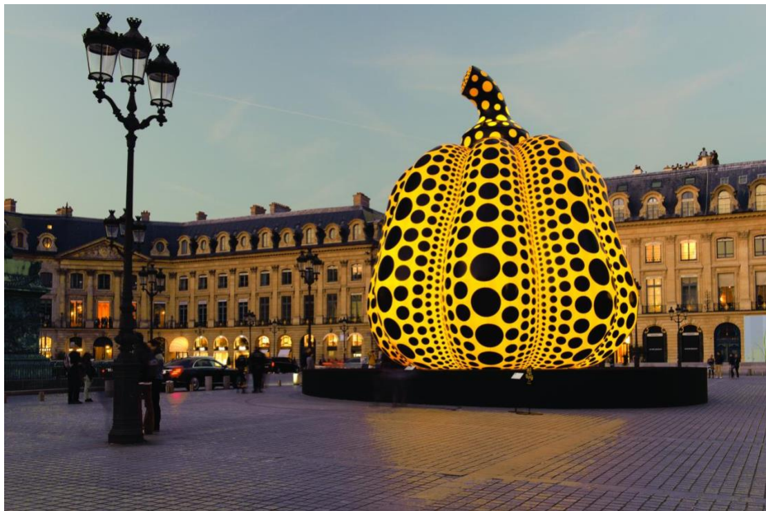
Life of the Pumpkin Recites, All About the Biggest Love for the People, 2019 Installation view, FIAC Hors les Murs, Place Vendôme, Paris © YAYOI KUSAMA, Courtesy of Ota Fine Arts, David Zwirner, Victoria Miro and YAYOI KUSAMA FOUNDATION.

HEYTEA is proud to sponsor the CHINA PROJECT OF LOVE & LIFE, which will launch in China from November 12-17, 2024, at North Bund Shanghai, China.