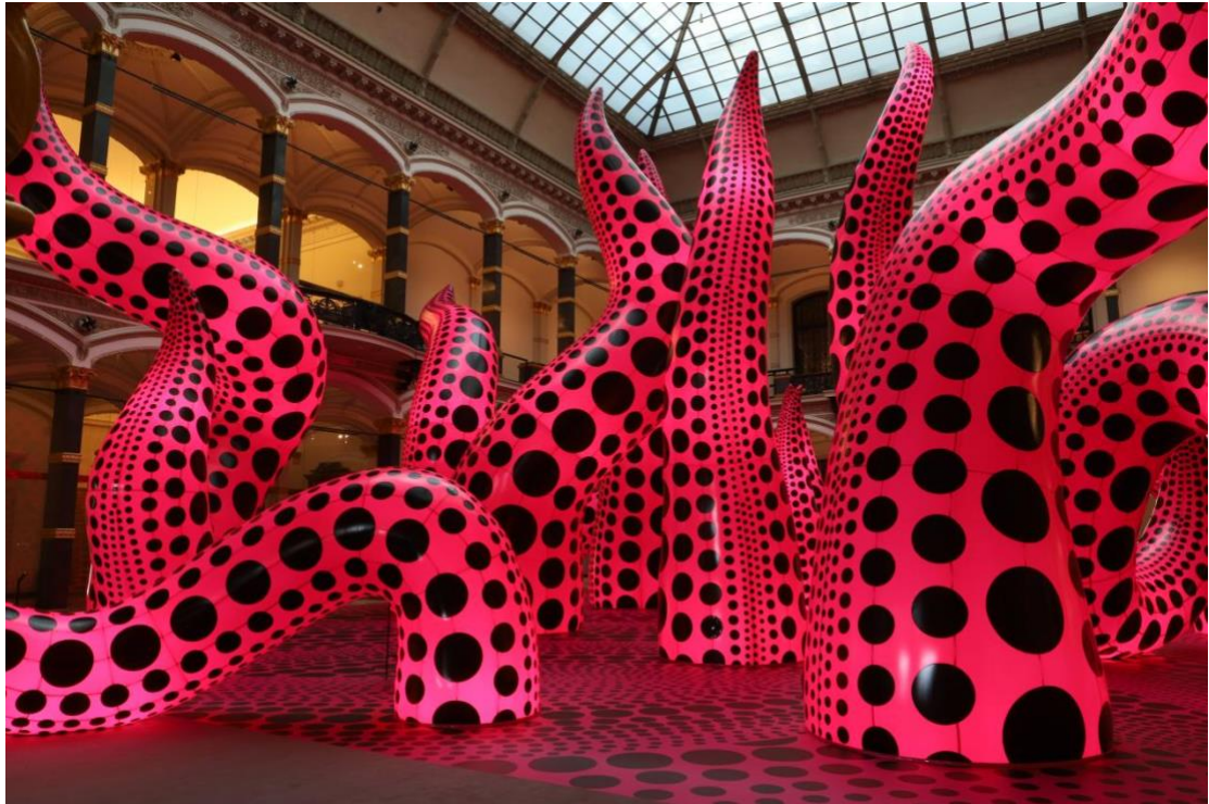
A Bouquet of Love I Saw in the Universe , 2021, Installation view at Gropius Bau, Berlin. ©YAYOI KUSAMA, Courtesy of Ota Fine Arts, YAYOI KUSAMA FOUNDATION