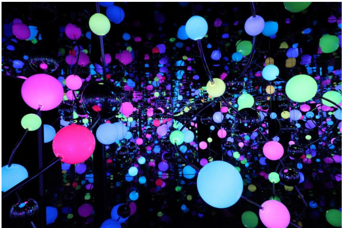
Infinity Mirrored Room—The Eternally Infinite Light of the Universe Illuminating the Quest for Truth , 2020, ©YAYOI KUSAMA, Courtesy of Ota Fine Arts, YAYOI KUSAMA FOUNDATION