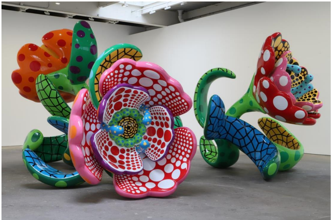
I Spend Each Day Embracing Flowers , 2023, Installation view at David Zwirner, New York, ©YAYOI KUSAMA, Courtesy of Ota Fine Arts, YAYOI KUSAMA FOUNDATION